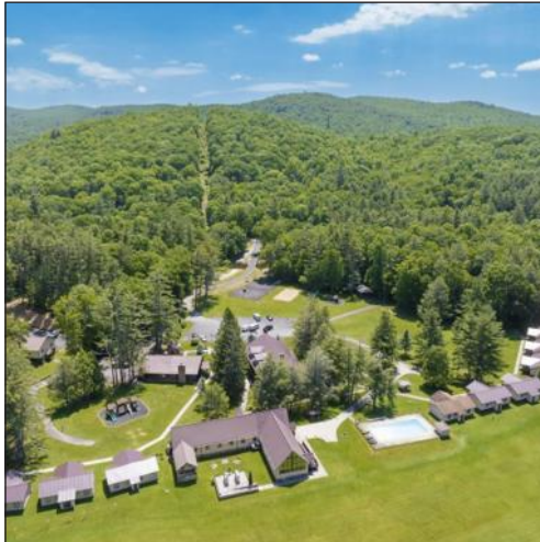
Camp Linn Haven in the mountains of NC

To help LCMS pastors' families the National LWML Grant #25 Pastoral Wellness for $15,000 will provide opportunities to come together at Camp Linn Haven in the mountains of western North Carolina for a week of