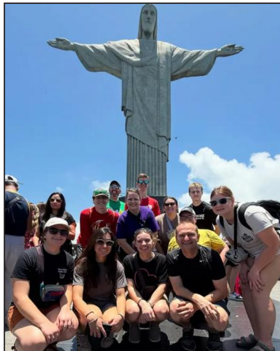
The photo above shows our mission team a year ago at the Cristo Redentor statue in Rio de Janeiro, Brazil (January 2025).

Then, there is the cost of the trip. Each of us is contributing $1,400 as a personal commitment to reserve our place and for the support of the trip. But the whole trip will cost more when you factor in various needs (project supplies, VBS needs, food, lodging, transportation, etc.) per person. We believe that God will use many of you to assist in providing the necessary funds for this mission. So, whatever the Lord leads you to share will be a blessing for not only our team but also for the people of Panama.