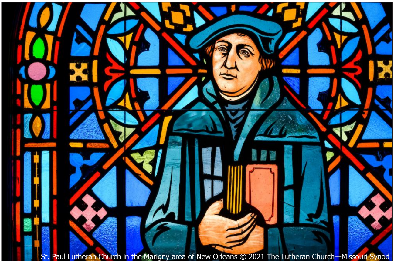
St. Paul Lutheran Church in the Marigny area of New Orleans

"I am bound by the Scriptures I have quoted and my conscience is captive to the Word of God. I cannot and I will not retract anything, since it is neither safe nor right to go against conscience. I cannot do otherwise, here I stand, may God help me, Amen."