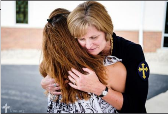
Guiding and helping the mentally ill through this LCMS Life Ministry!

The 41 st Biennial Convention will be held in Omaha, Nebraska on June 26-29 with the theme being "Growing