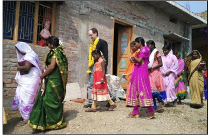
Processing into the church in India.

The National LWML Mission Grant #25 is "Bringing God's Word to India" for $100,000. The Lutheran Study Bible is being translated into the sixteen major languages of India. We pray that the Lord would bless this translation work and strengthen the faith of all believers in India.