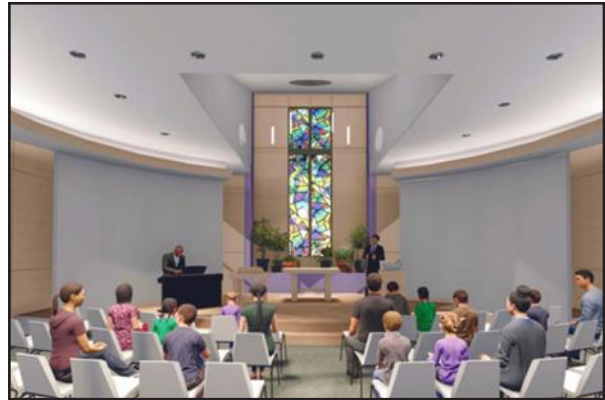
The architect's projection for the chapel at Dakota Boys and Girls Ranch in Bismarck, ND. "Finally, be strong in the Lord and in His mighty power."

The National LWML has a mission goal for the biennium 2023-2025 of $2,350,000. One of the mission grants that has been fully paid is Mission Grant #2 for $100,000 "A Healing Space for At-Risk Children at Dakota Boys and Girls Ranch Bismarck, ND." A gap in the spiritual care of the many children from ages 10 - 18 has been a chapel facility that is designed for traumatized boys and girls. The hope is that being in a chapel setting will serve to help these children to experience the mercy of Christ and His healing power.